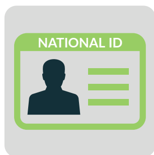
National ID card *