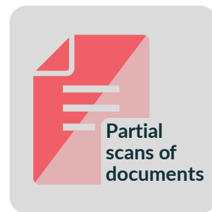
Partial scans of documents

This can include only providing the first page of a multi-page document (We need clear full copies of all pages).