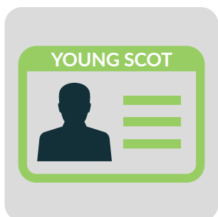
Young Scot card

*National ID cards, UK residence cards and biometric passports. Please provide a full scan of the front and back of the card.